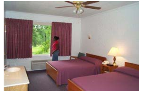
Newly remodeled room overlooking Lake Lemons

After several months of construction and remodeling, the Pasadena Blvd UMC Guest Quarters is complete and in full use. Formerly the Central Building Motel wing, the renovated guest quarters sports a complete make over from top to bottom. Many amenities such as in-room vanities, ceiling fans, individual room a/c, and added lighting were added to the rooms during construction. The result is a beautiful and very comfortable motel-style facility rivaling those of the Family Life Center.